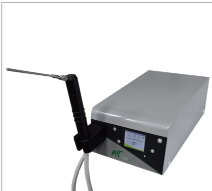
AQUATOP XS | Ear syringe