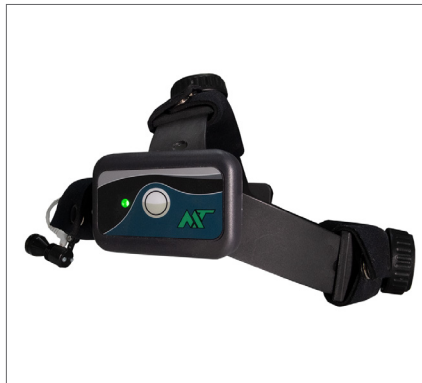
MEDITOP LED HEADLIGHT