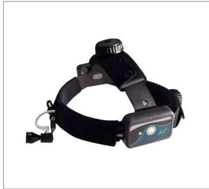
MEDITOP LED HEADLIGHT