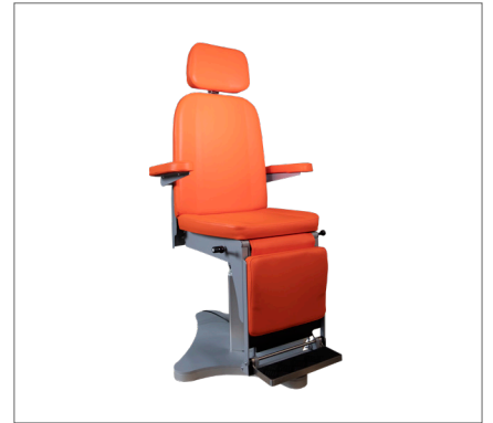
MEDITOP COMFORT CHAIR